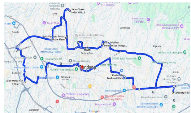
Fig. 3 The vehicle route generated by the nearest insertion method

Based on the route obtained using the Nearest Insertion method, the total travel distance is 68,1 km. The vehicle route generated by the Nearest Insertion method is shown in Figure 3.