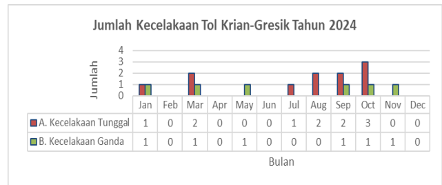
Figure 2. Data on the Number of Accidents on the Krian Gresik Toll Road in 2024

Based on Figure 2, it can be seen that the number of accidents that occurred in 2024 was 17 cases, with the highest number in October 2024, 4 cases consisting of 3 single accidents with factors such as tire blowouts and brake failure, and 1 double accident suspected to be due to driver drowsiness. Single accidents occur more frequently than double accidents. This could indicate problems such as high speed, drowsiness while driving, lack of signs or lighting, and weather factors (slippery roads). The sharp increase in March, September, and October could be caused by increased traffic volume due to long holidays, collective leave, or seasonal changes.