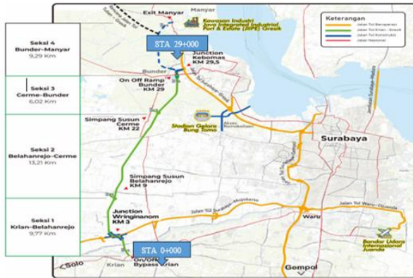
Figure 1. Location of the Krian-Gresik Toll Road Section KM. 0+000-29+000