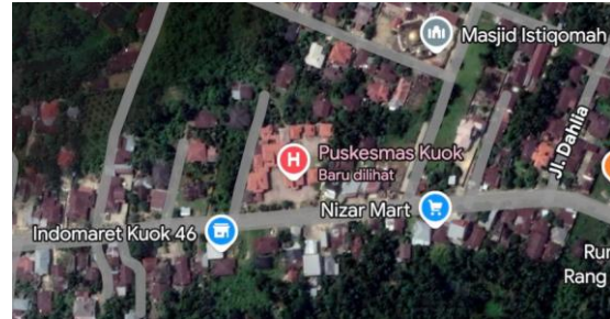
Figure 2. Illustration of SRP Staff Parking Area of Kuok Health Center