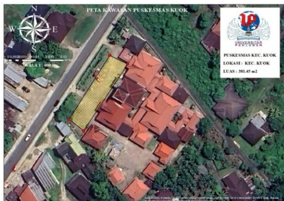
Figure 3. Parking Area for Visitors of Kuok Puskesmas

The selection of this location is based on the consideration that the Kuok Community Health Center is the only primary healthcare facility in Kuok District, resulting in a relatively high visit